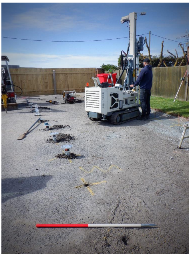
Plate 4. Ground boring- 1m scale (looking NW)