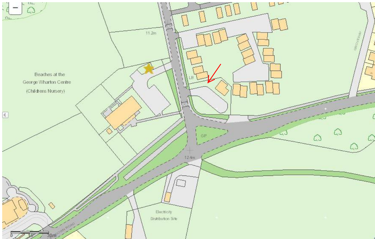
Figure 1. KCCHER map of site location at NGR 602550 170664 (red arrow)