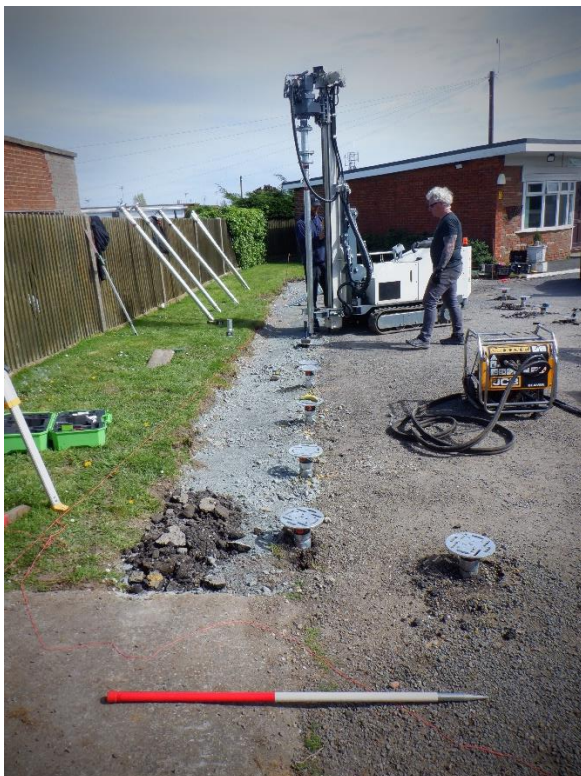
Plate 2. Ground boring -1m scale (looking NE)