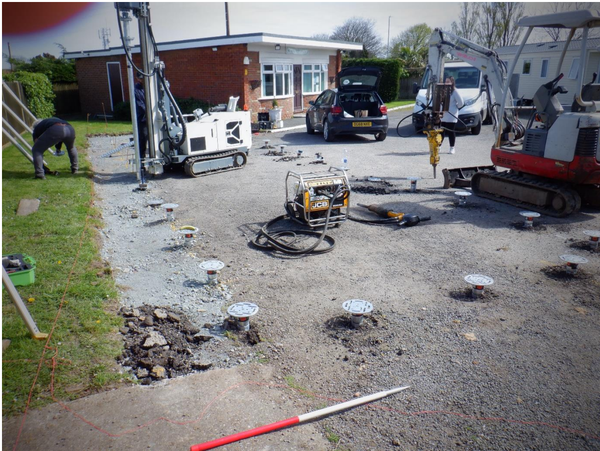
Plate 1. Setting out and starting ground boring for steel foundation screws (looking East)