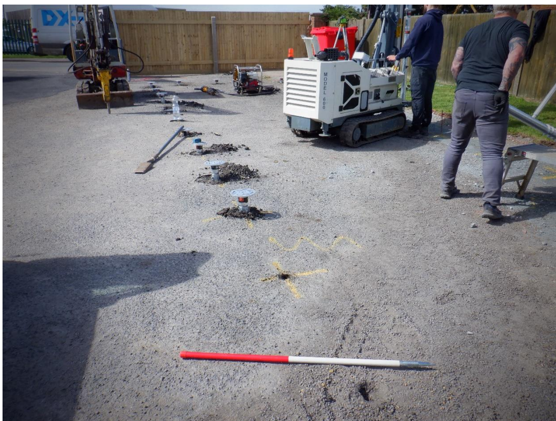
Plate 3. Setting out and ground boring- 1m scale (looking West)